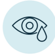
Red, watery eyes